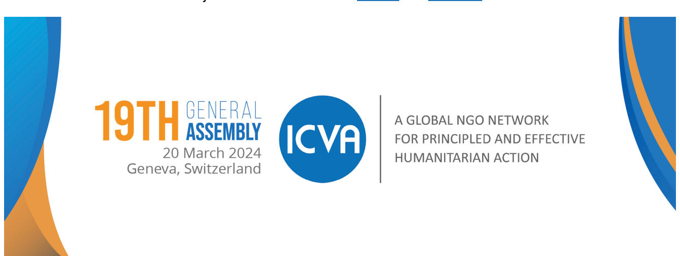
19th General Assembly

Use #ICVAconference2024 to join the conversation on <u>Twitter</u> and <u>LinkedIn</u>.