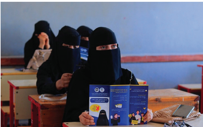
FAF developed PSEA materials to explain core concepts and reporting mechanisms, which were distributed during awareness-raising sessions held in the governorate of Lahij, Yemen.

FAF implemented its planned PSEA activities in the districts of Tuban and Al Madaribah Wa Al Arah (governorate of Lahij). The NGO developed PSEA materials in Arabic, including 1,200 brochures, 1,200 posters, and 200 information booklets for 1,200 members of affected communities, including refugees, internally displaced persons, and persons with disabilities. The printed materials that were disbursed during 50 awareness-raising sessions aimed to explain core PSEA concepts, highlight key messages, and provide information on available reporting channels and support services. Finally, the NGO organized 50 interactive community workshops and training sessions targeting 200 staff and volunteers, which aimed to inform and provide guidance about PSEA and available support services and reporting mechanisms.