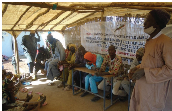
Action Mopti organised 30 awareness-raising sessions on PSEA for IDPs living in Djenné, Mopti and Bandiagara, Mali.

Action Mopti conducted 30 awareness-raising sessions with 3,900 IDPs living in the areas of Djenné, Mopti and Bandiagara. The NGO developed 24 image boxes, 400 leaflets, and 400 posters in French to inform about PSEA principles and available reporting mechanisms. Action Mopti produced and broadcasted 14 radio roundtables and 5 audios to disseminate awareness-raising messages in Bambara, Fula, Dogon, French, and Songhay on PSEA, explaining core PSEA concepts, the rights of affected communities, obligations of humanitarian workers and provide information on how and where to report. Action Mopti also set up 10 protection committees, each composed of 6 IDP women and 4 IDP men, and trained them on safe programming, PSEA risk mitigation, and the functioning of community feedback mechanisms, so as to strengthen their participation and engagement in humanitarian projects implemented in IDP camps. Through the creation of discussion spaces, these protection committees linked to other stakeholders, including NGOs and local authorities.