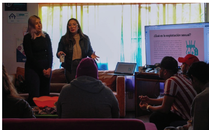
Through informative workshops, Espacio Migrante informed migrant, IDP and refugee communities living in and passing through Tijuana, Mexico, about SEA risks, prevention and available reporting mechanisms and health services.

Targeting 183 members of the migrant, refugee, and IDP communities living in and passing through Tijuana, Espacio Migrante organised 10 informative workshops to raise awareness on PSEA. As certain workshops aimed to focus on specific vulnerabilities of certain groups, the NGO organised 6 workshops focused on children, one on migrant, refugee, and IDP women, one on members of the LGBTQIA+ community, and two workshops were held with humanitarian staff. Espacio Migrante designed and disseminated infographics in Spanish, English, Haitian Creole, and French which provide information on prevention, SEA risks, how and where to report, and the institutions that can provide support and mental health services. Published both physically and virtually through social media channels, the materials produced include 100 leaflets, 40 posters, and 1 video, which was developed in Spanish, French, English, and Haitian Creole. Espacio Migrante also conducted a training on PSEA and reporting mechanisms with 20 humanitarian workers.