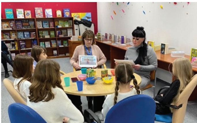
Focus Group Discussions with Ukrainian refugee children organised by SOK Poland.

SOK Foundation's PSEA project, supported by the national PSEA Network, developed 3 PSEA awareness-raising animation videos that targeted and reached more than 35'000 refugee women and children from Ukraine, including those from a Romani background, living in Poland. Disseminated through social media and other digital communication channels, the first video addresses children up to 12 years old, the second video targets young and adult refugee women while the third video places the focus on refugee women and children of Romani origin. Available in multiple languages, including Polish, Ukrainian, English, and Romani, and allowing for captioning in these 4 languages, the videos aim to educate women and children on the topic of PSEA, the importance of their rights to report SEA as well as inform about available reporting channels.