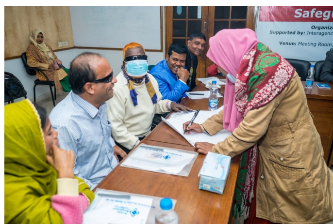
Access Bangladesh organised PSEA trainings in Cox's Bazar, Rangpur and Dhaka to enhance the capacity of humanitarian aid workers and other relevant actors.

Access Bangladesh Foundation organised a national community radio campaign by broadcasting 10 radio dramas in 10 local dialects via 10 community radios aiming to clarify what SEA in emergency situations is and where available reporting channels can be accessed and how. Through the radio campaign, nearly 500,000 persons were reached. To enhance capacity of humanitarian aid workers and relevant actors on PSEA and reporting systems, 3 trainings were organised in Cox's Bazar, Rangpur and Dhaka with 65 participants including 33 Female, 32 Male and 24 persons with disabilities. In addition, IEC materials which included 2,000 posters, 2,000 leaflets, 2,000 stickers, 2,000 pens, 500 T-shirts in both Bengali and Burmese languages, were produced and disseminated to roughly 10,000 persons. Multimedia talking and braille versions of the poster, leaflet and stickers were also made available. 22 accessible videos were uploaded in the organisation's Facebook page as a social media campaign and an accessible animation video has been produced in both Bangla and Rohingya language with sign language interpretation to raise awareness on PSEA issues and inform on available reporting channels. Targeting 300 humanitarian organisations, OPDs, community organizations and women-focused networks, a short report on inclusiveness status of PSEA campaigns and communication materials has been developed and shared with the relevant agencies to make their PSEA interventions more inclusive.