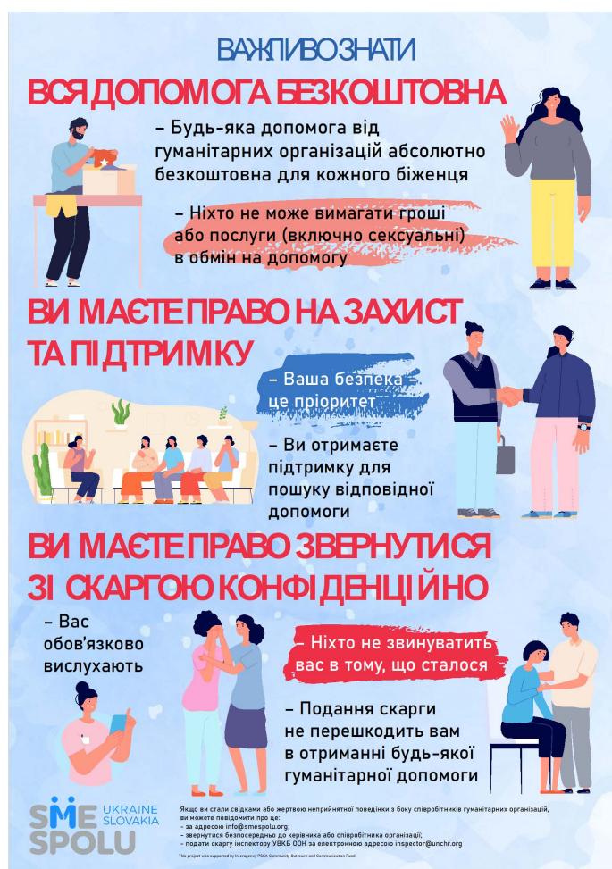
SME SPOLU developed and disseminated 2 posters in Ukrainian to inform refugees about key PSEA principles and reporting channels.

SME SPOLU organized an awareness-raising campaign on PSEA and reporting mechanisms throughout Slovakia. During the project, 2000 flyers with PSEA core information were disseminated, 6 in-person meetings and trainings with 78 humanitarian workers and refugees were held and 10 social media posts were shared regularly through the organization's social media accounts and which reached more than 10'000 persons. Additionally, 2 posters were placed in the premise of the organization reminding humanitarian workers about key PSEA principles and informing refugees about their rights and available reporting channels, targeting 2,000 Ukrainian refugees living in Bratislava and surroundings.