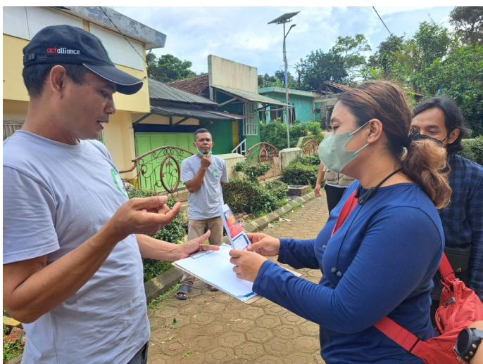
During the 2022 Cianjur earthquake response, MPBI conducted a PSEA risk assessment in the region.

Under its PSEA project, MPBI developed 15 infographics, a comic and a video in both English and Bahasa Indonesia focused on raising awareness on PSEA, which were shared with more than 2,000 aid workers and volunteers through 78 WhatsApp groups and social media channels. The NGO also conducted two webinars with over 2,000 participants from more than 120 grass-root organisations across Indonesia and with a particular focus on those working on the 2022 Cianjur earthquake response. MPBI organised a training for 23 PSEA Network focal points and held a workshop to which 30 representatives from government and non-government stakeholders were invited, including national and international NGOs and UN agencies. The aim of the workshop was to foster dialogue on PSEA among the participants, to build on existing capacities and to discuss a path to move forward in strengthening policies and regulations in relation to PSEA. During the 2022 Cianjur earthquake, MPBI conducted a PSEA risk assessment in the region affected through the organisation of focus group discussions with 50 participants from affected communities, interviews of aid workers and volunteers from 4 humanitarian organisations and by conducting sensitisation campaigns on PSEA with 24 female and 26 male aid workers working on the earthquake response.