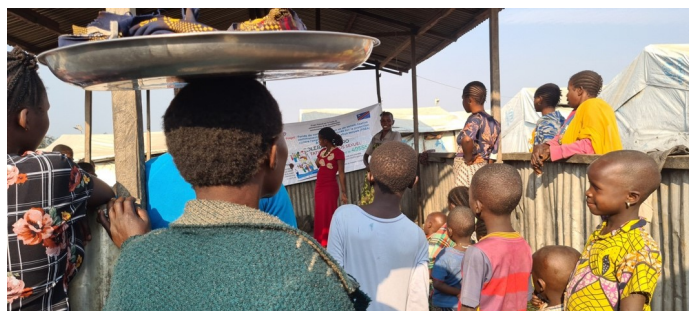
FECONDE organised PSEA awareness-raising campaigns in Bunia, Marabo, Komanda and Mambasa to inform community members on PSEA and available reporting mechanisms.

Danwadaag Relief Alliance (DRA) carried out a PSEA awareness-raising project targeting 1,800 IDPs and 300 members from the host community living in Lower Juba, Somalia. The NGO developed and disseminated 2,000 posters and 5 banners in Somali and English, set up a mobile communication unit, which reached 10 IDP camps in Lower Juba, and broadcasted short PSEA radio messages through 2 radio talk shows, which reached 1'800 IDPs. Furthermore, DRA organised 1 training workshop with 20 humanitarian workers, 1 workshop with 40 community gatekeepers and 1 training of community based PSEA focal points with 20 community members, including community elders and humanitarian workers. The trainings and workshops focused on sharing information on the meaning of sexual exploitation and abuse, types of exploitation and abuse, available reporting channels in Somalia and the six core PSEA principles.