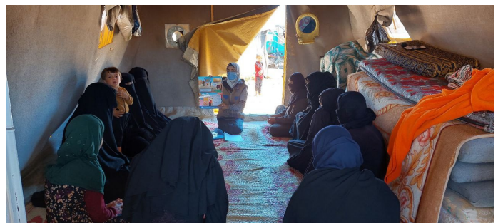
MHD organised awareness-raising sessions on PSEA with women, men, and children in the various camps around Aleppo and Idlib.

Under its PSEA project targeting host and displaced communities in the cities of Aleppo and Idlib, MHD organised 10 Focus Group Discussions with members of host and displaced communities to engage them in the development of the project and design of messaging and deliverables. The NGO also organised 4 Trainings of Trainers (ToTs) for volunteers and staff to train them on how to provide workshops and awareness-raising sessions on PSEA. The NGO organised 110 awareness-raising sessions within the camps which focused on informing about SEA, presenting reporting channels and explaining how to use them through the distribution of 7,000 posters, 35 roll-up banners and 35 horizontal banners. For children, the NGO developed plays in puppet theatre to share information on PSEA in a child-friendly manner. 26 workshops with humanitarian workers and non-humanitarian workers, including health workers, camp managers and members of local councils were conducted with the aim to raise awareness on PSEA, explain PSEA concepts and how to engage with communities on issues related to PSEA. In addition, the NGO developed and disseminated 3 short videos and audio clips that were shared via WhatsApp and conducted a PSEA needs assessment.