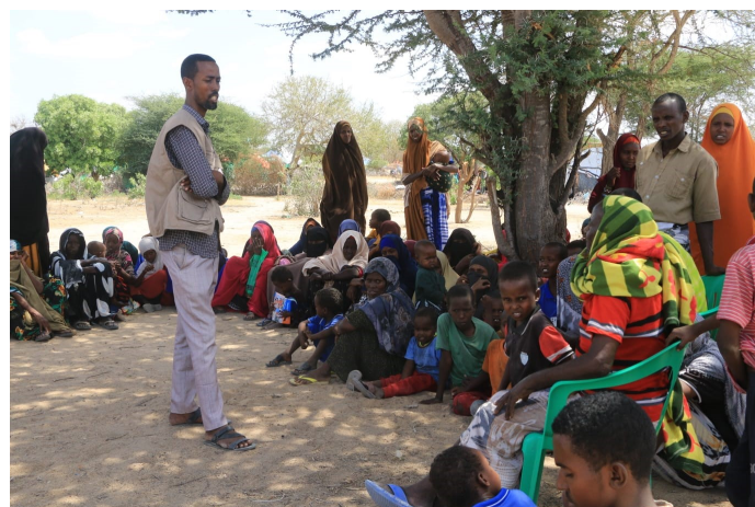
DRA conducted monthly community conversations on PSEA with IDPs in Dhobley.

The PSEA trainings covered topics including key definitions, the Six Core Principles, consequence and barriers to SEA reporting, and complaints mechanism. RIPDO designed, printed, produced, and distributed IEC materials in English which include 60 T-shirts, 3 banners, 30 PSEA awareness booklets, 30 PSEA training booklets and 30 PSEA posters. Finally, RIPDO developed 2 radio talk shows and 6 radio jingles in five languages: English, Arabic, Lotuko, Lango and Acholi.