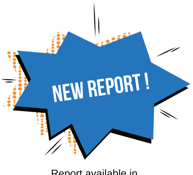
Report available in English