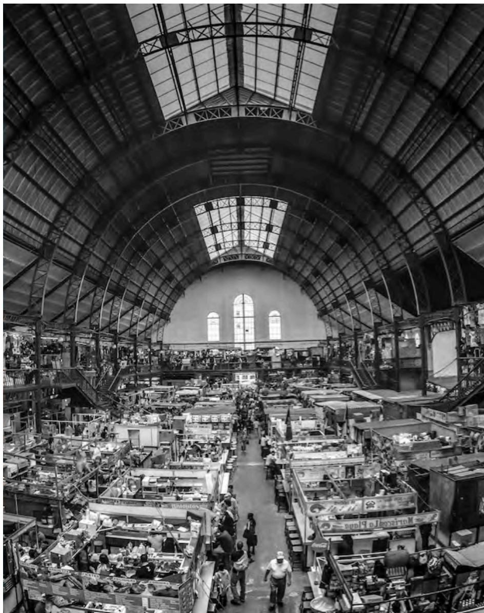
An overview of the National Center for Epidemiological Emergencies and Disasters warehouse in Mexico. 2020, Mexico.