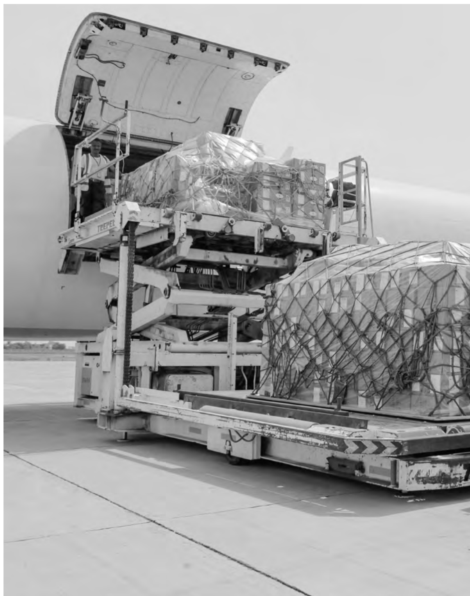
Medical supplies and personal protective equipment arrive at Aden Airport. 2020, Yemen.