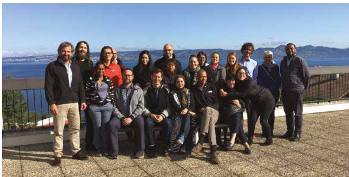
Staff photo, October 2019