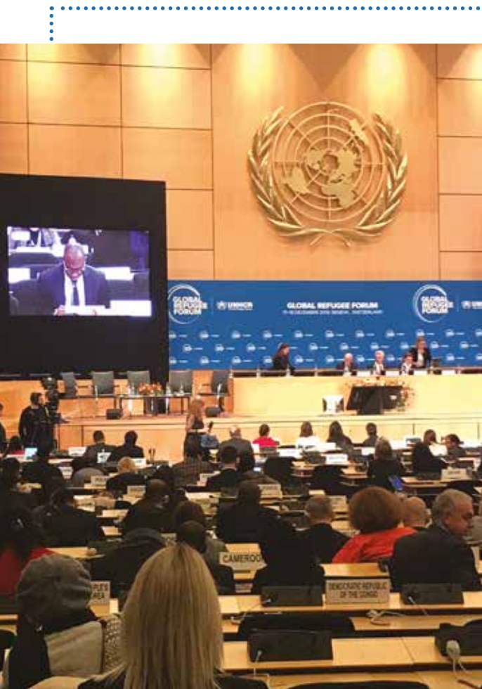
Global Refugee Forum 2019

Additionally, ICVA will continue to contribute to the work and the thematic priorities of the Action Committee on Migration, with a focus on migrants in vulnerable situations, especially in transit. ICVA will also support NGOs in their implementation of the Global Compact on Migration and its complementarities to the Global Compact on Refugees.