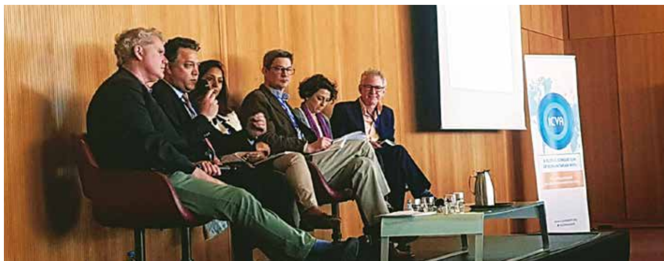
ICVA Annual Conference 2019

This new focus area in 2019, looks to develop strategic thinking in navigating different cross cutting issues of Nexus, localization, civil society space, diversity and inclusion, PSEA, and risk management and their interconnections with each other and across the ICVA focus areas of forced migration, coordination and financing.