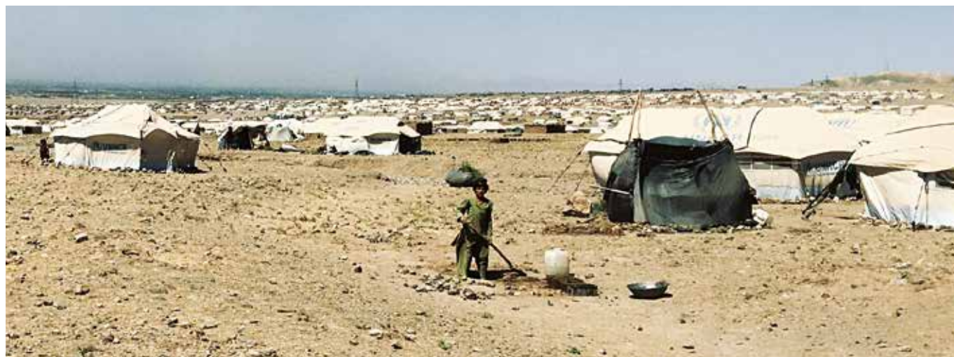
IDP camp Herat, Afghanistan