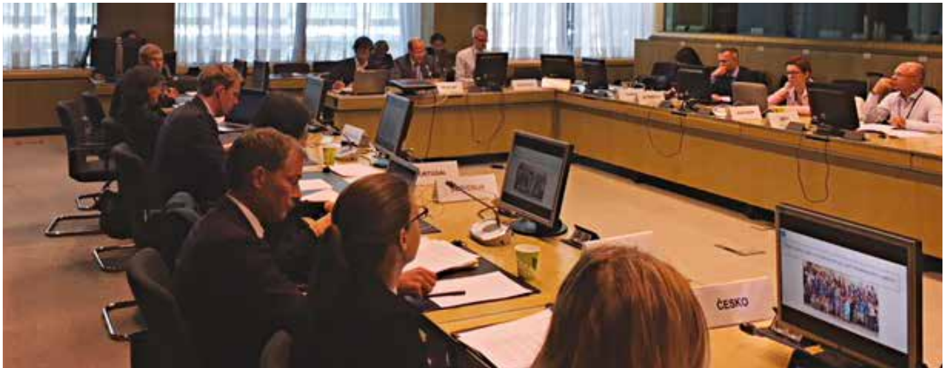
COHAFA Council of EU 2019