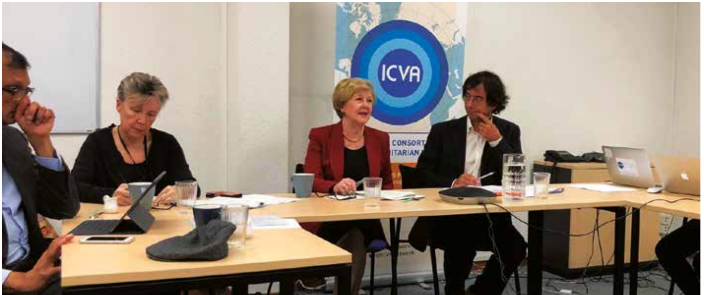
Gillian Triggs, UNHCR Assistant High Commissioner for Protection