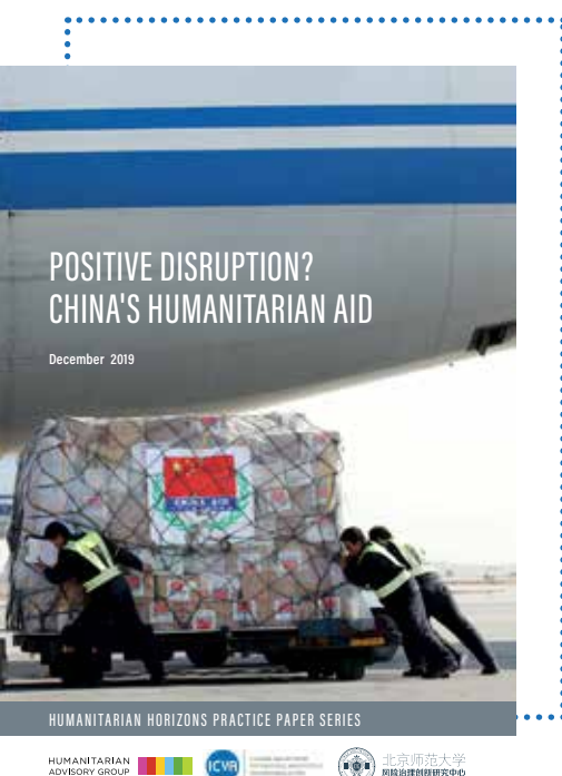
ICVA Briefing paper "Positive Disruption? China's Humanitarian Aid"

ICVA hosted a staff member from FM4/Paso Libre for a three-month secondment. The purpose of the secondment was to develop humanitarian NGO capacity in Latin America in the years to come by informing and influencing ICVA's work and for ICVA to better service and develop its Latin American NGO members. The secondment contributed to developing sustainable participation and representation of Latin American NGOs within the ICVA network.